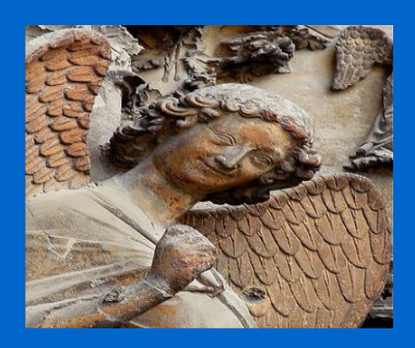
Where did Noah keep his bees? --In the ark hives

Blessed Sacrament Seminole Council Knights of Columbus #17162 11565 66<sup>th</sup> Avenue Seminole, Fl. 33772