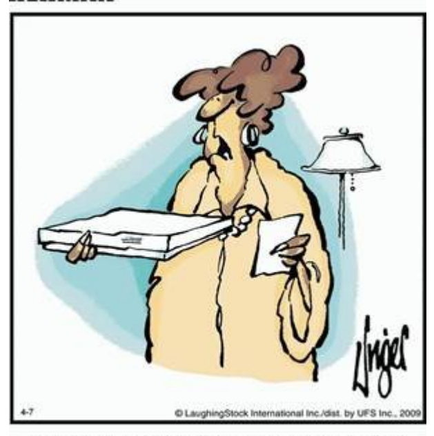
"I don't want to worry you, but the guy who delivered the pizza was your financial planner."