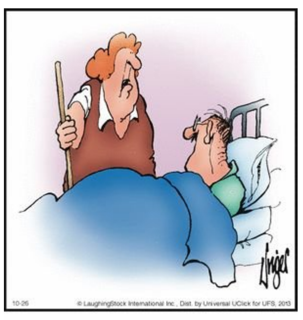
"I phoned your office and they didn't even know you were off sick."