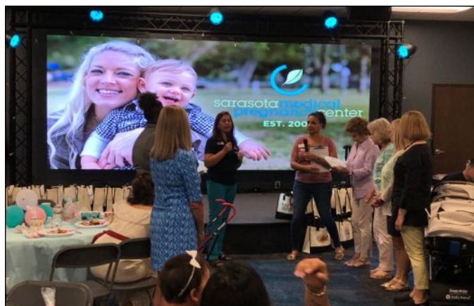
photo at the SMPC EWYL Graduation