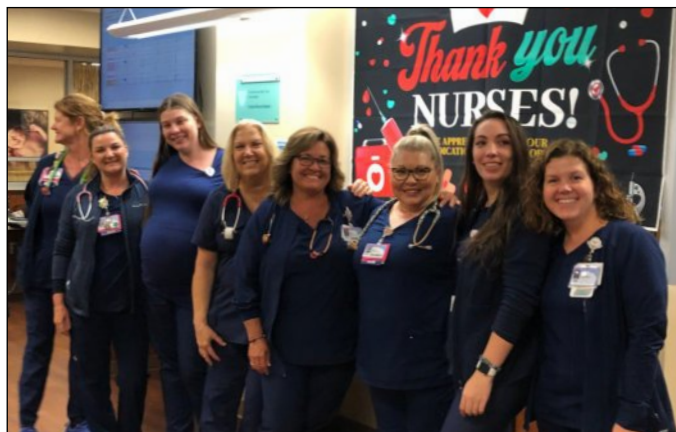
Photo of nurses at one of the many nurse stations at SMH