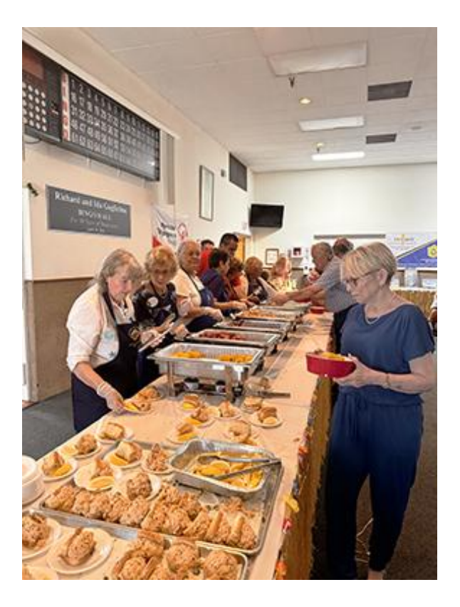
Ladies Auxiliary serving the food