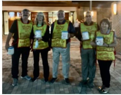
Saturday 7 PM Mass