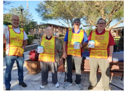
Sunday 7 AM Mass