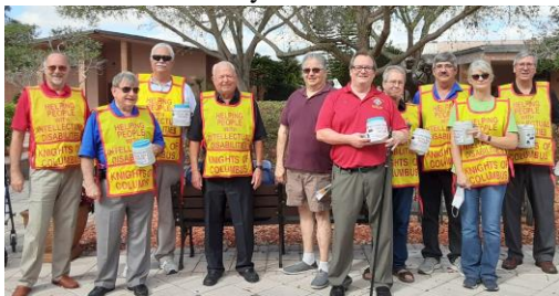
Sunday 9 AM Mass