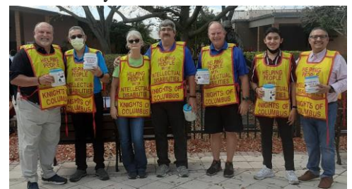
Sunday 1 PM Mass