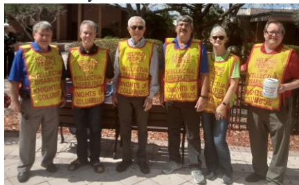
Sunday 11 AM Mass