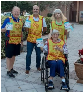
Saturday 5 PM Mass