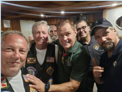
KoB members with FI State Deputy