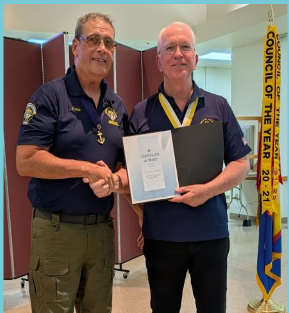
Special Awards for Casino Night & Car Raffle