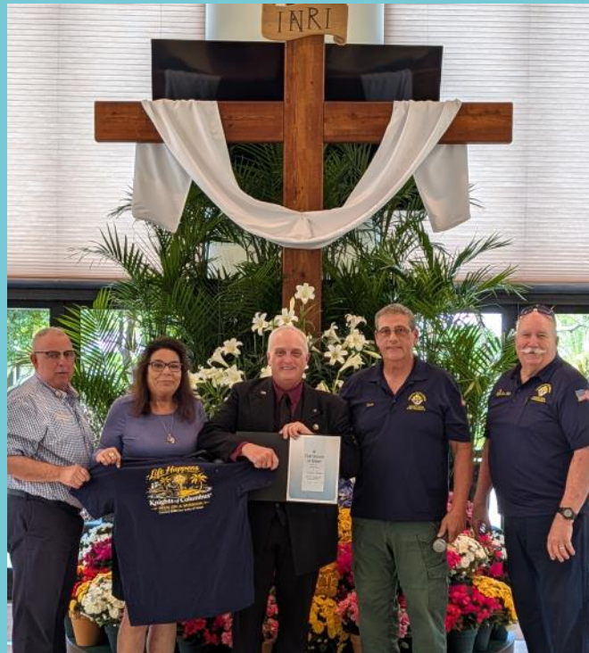
Merit for Recruiting Video