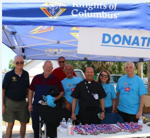
LAPS FOR LIFE TENT