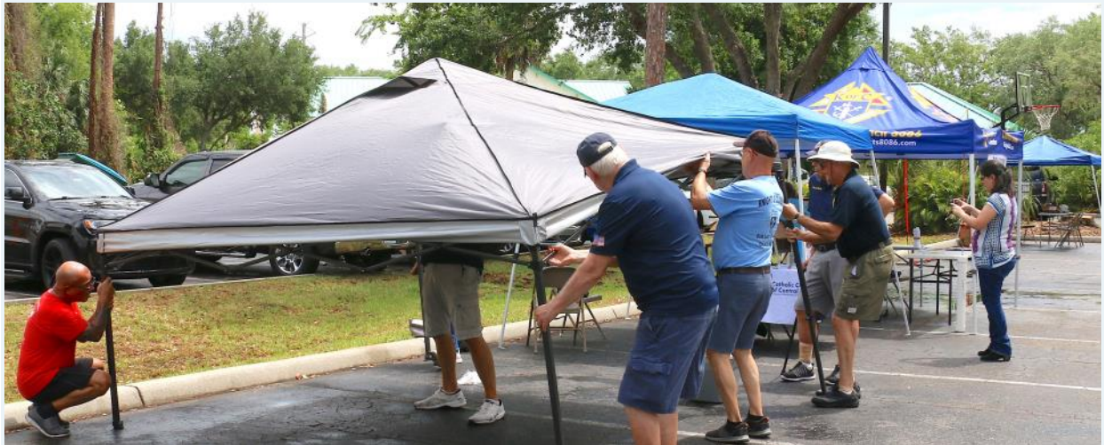
KNIGHTS SETTING UP TENTS