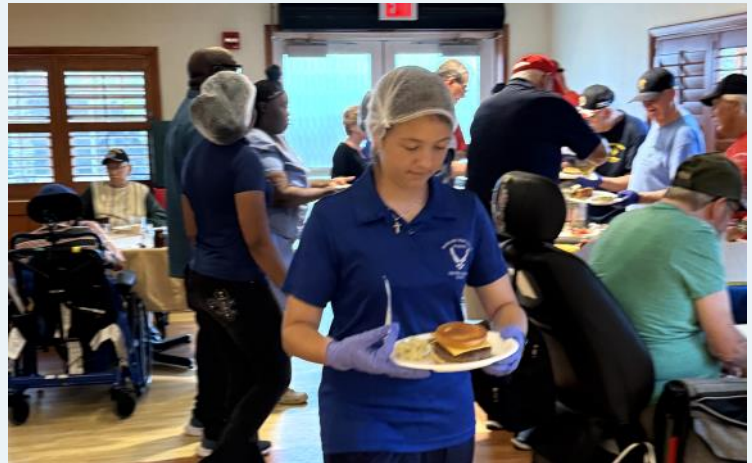
Veterans bring their own chairs. They enjoy a Knight of Columbus lunch of hotdogs, hamburgers and the works.