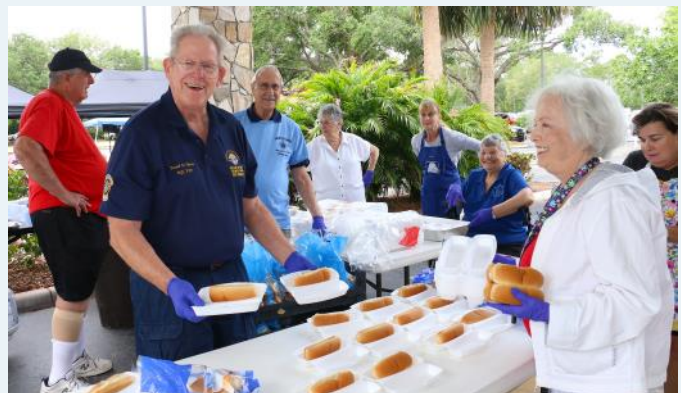
COOKING AND SERVING FOOD