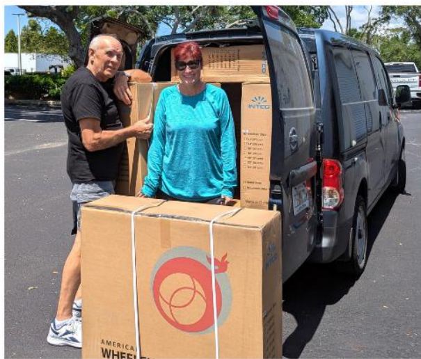
Van full of Wheelchairs