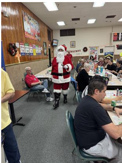
Here comes Santa Claus right down Santa Clause lane.