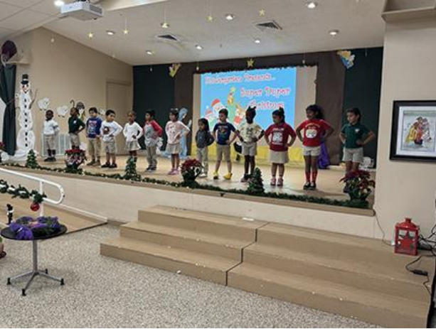
Students performing Christmas song.