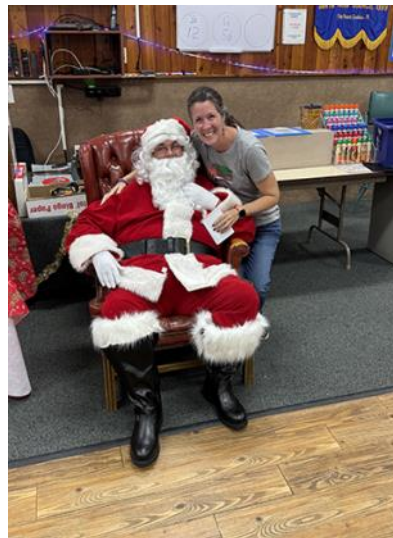
Santa Clause giving out presents.