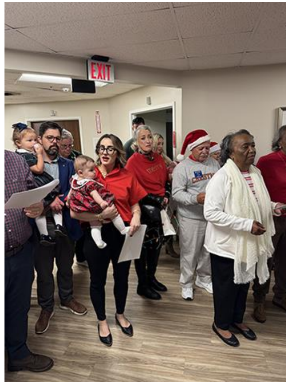
St. Francis choir along with Council 4999 singing Christmas Carols for the people living at Prosper Health and Rehab.