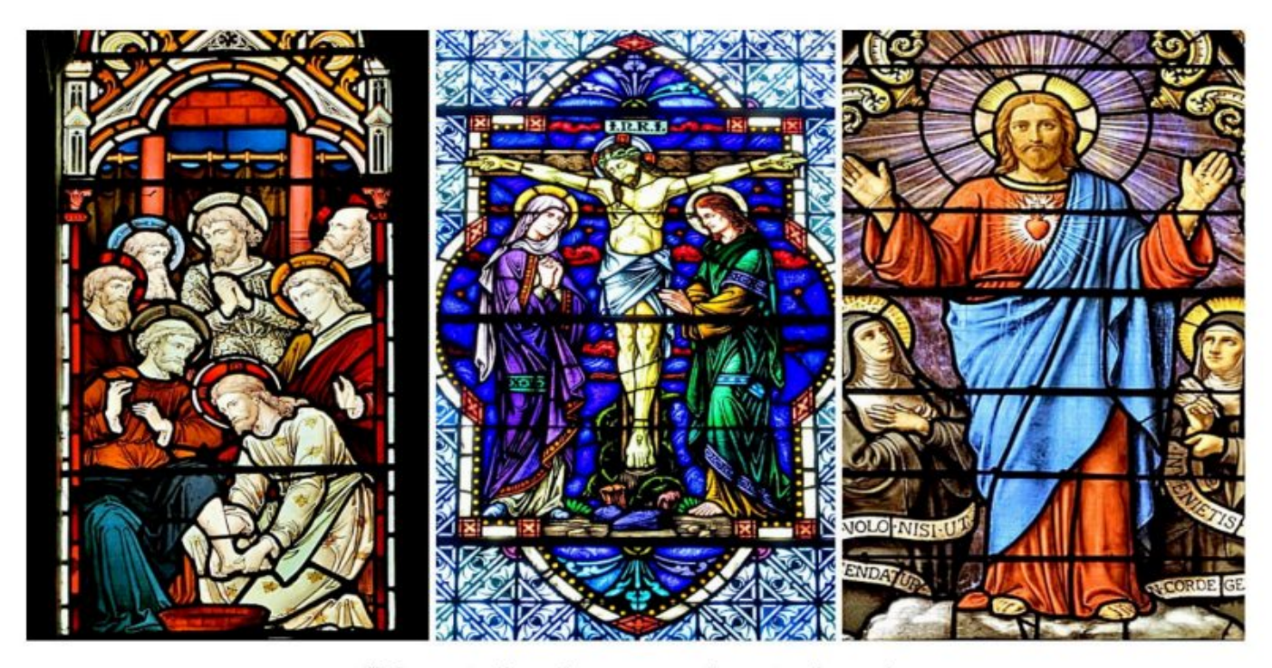
"Do not abandon yourselves to despair. We are the Easter people and hallelujah is our song."