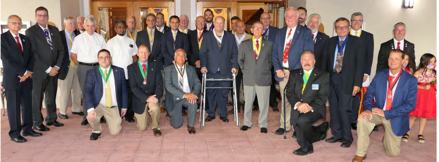
New officers for Councils 4955 and 3080 formally were installed following Mass at Assumption Church July 23 with Fathers Nathan and Greer. Dinner was at Sea Ranch Lakes Beach Club.